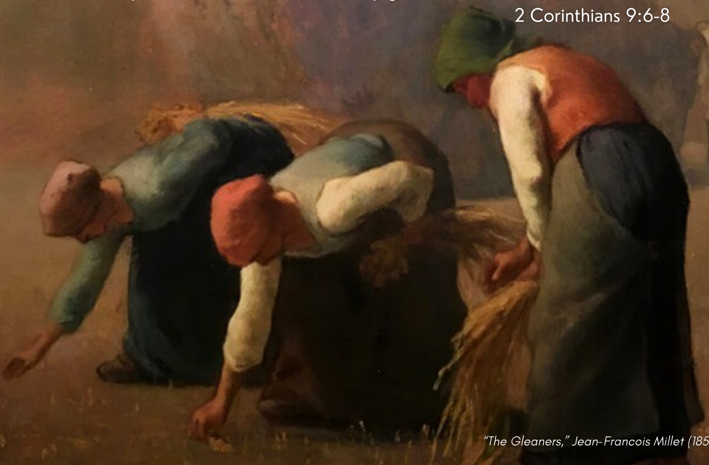
"The Gleaners," Jean-Francois Millet (1853)